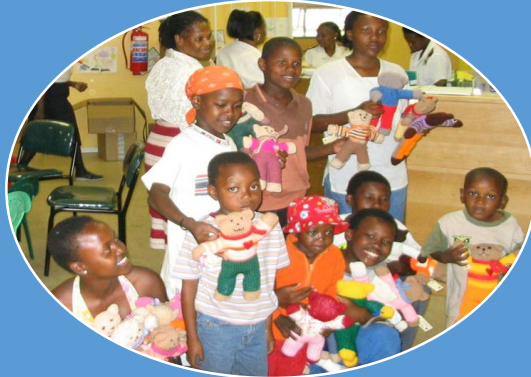
Supported pediatric care within general care → adult care