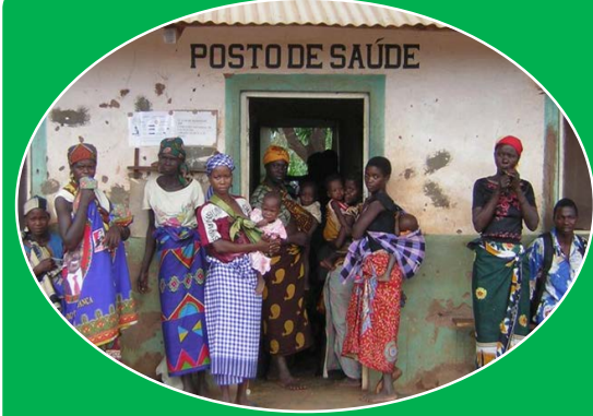
Completely integrated pediatric-adult care