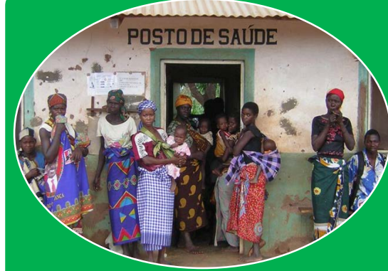
Completely integrated pediatric-adult care