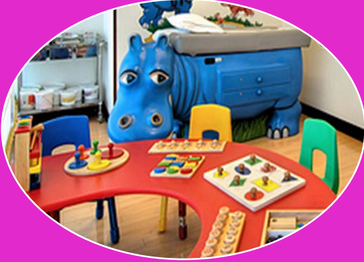
Specialist pediatric care → adult care