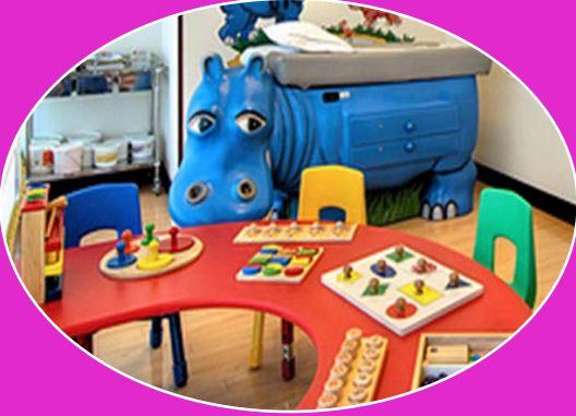
Specialist pediatric care → adult care